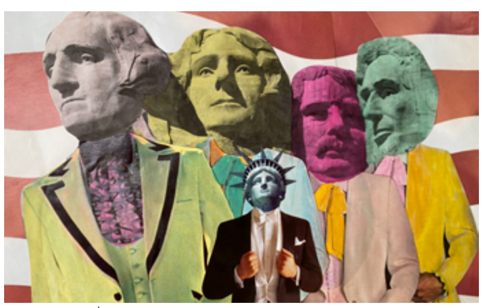
DOK Leipzig 2020 | Frankly Caroline

The programmes offer insight into the history of the festival and film in general, focus on the work of outstanding directors and explore the intersection of media art and animation. This year, in the spirit of the hybrid festival, the programmes will be shown to the public in cinemas and will be accessible online throughout Germany.