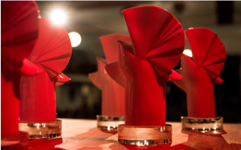
DOK Leipzig 2020