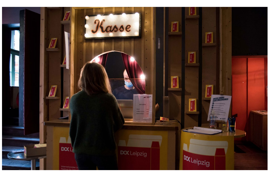
DOK Leipzig 2020

In a move that sends a positive signal for the resumption of cinema culture in the wake of the pandemic, DOK Leipzig will return to big screens in the fall. First, the complete film programme will air in selected Leipzig venues during the festival week in late October. And afterwards, "DOK Stream" will launch online to serve those who wish to either deepen their festival experience or visit DOK Leipzig wholly online. The virtual film programme will feature a selection of festival films accessible to the German public during the first two weeks of November.