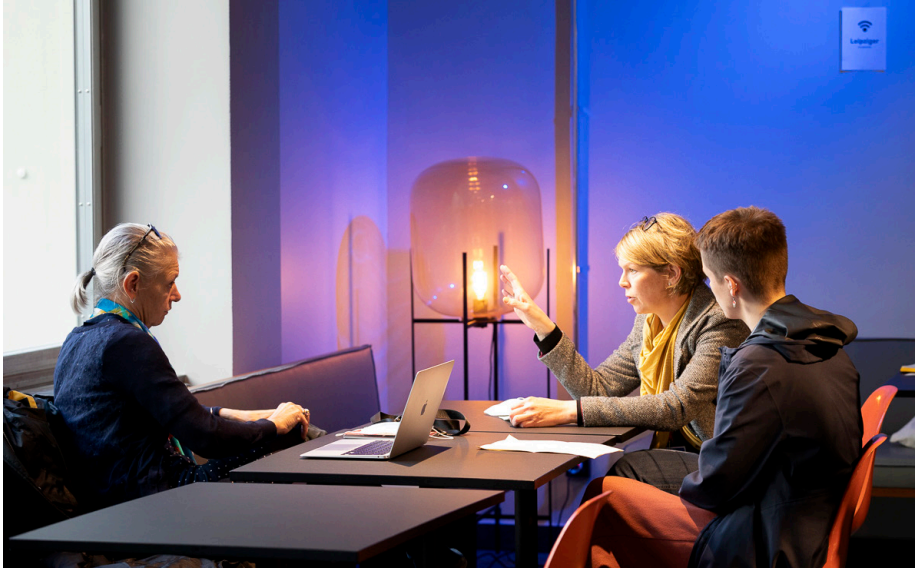
DOK Industry 2021

Presenting the first DOK Archive Market | Additional programme themes: diversity and representation in the film industry, plus networking for documentary and animation filmmakers