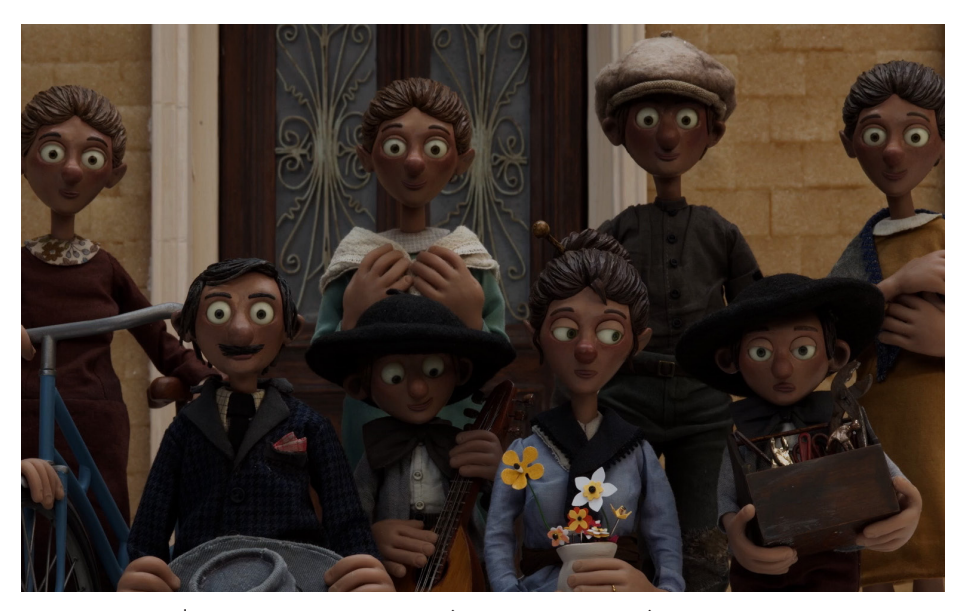
DOK Leipzig 2022 | "No Dogs or Italians Allowed" (director: Alain Ughetto)

Alain Ughetto's stop-motion film tells a story of rural life and migration in the early 20th century | German premiere in Leipzig