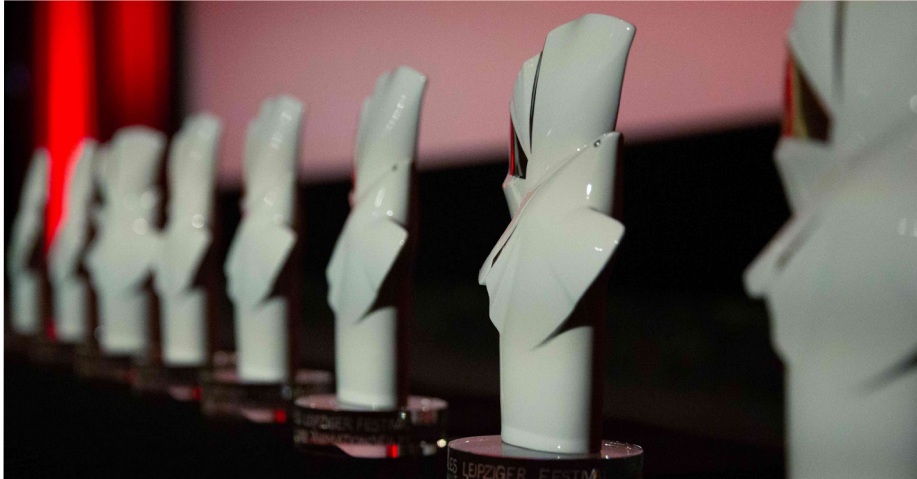
Silver Dove at DOK Leipzig 2021

The 1,500-euro award is sponsored by SLM | IG Metall is also sponsoring an award for the first time