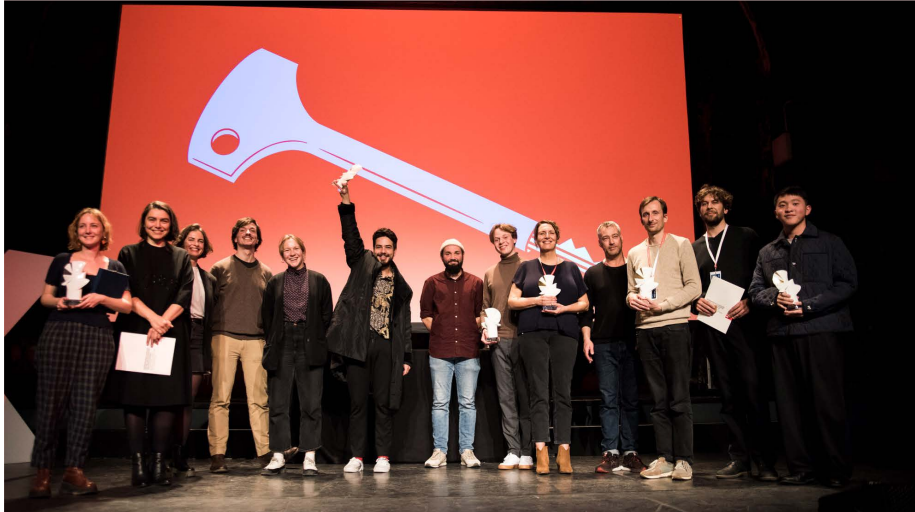
DOK Leipzig Award Winners 2022

Numerous young viewers reached | Film industry shows strong interest in DOK Industry events