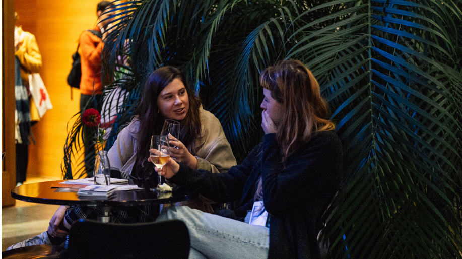
DOK Leipzig 2022 | Get Together Animation

DOK Industry partners with CEE Animation | Panel by German AG Animationsfilm on diversity in animated filmmaking