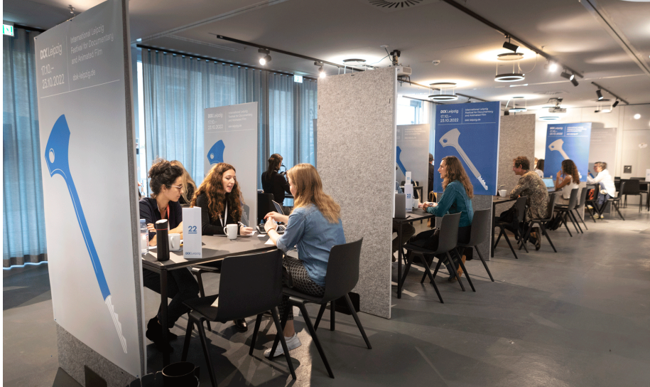
DOK Co-Pro Market 2022

Projects explore pressing issues of our time, expand the genre of true crime and offer outlooks on the future