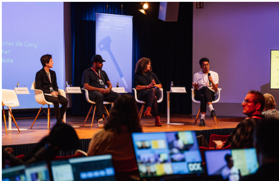
DOK Industry Talk 2022

In this year's edition, DOK Leipzig is presenting a DOK Industry Talk on Generation Ukraine, a new initiative by the ARTE Group aimed at supporting the Ukrainian filmmaking industry by co-producing 12 documentaries that explore Ukrainian reality in the throes of the ongoing war.