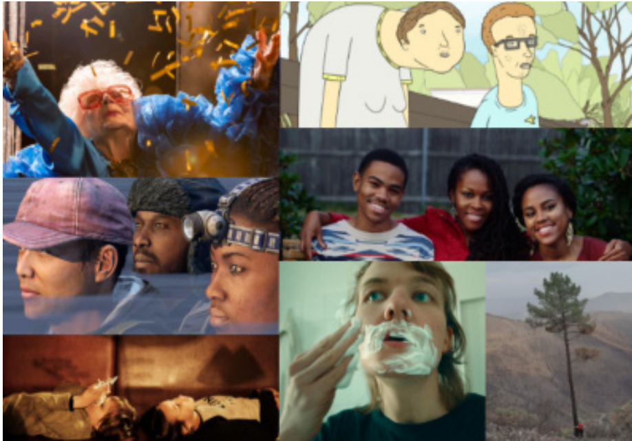
Stills of films in the DOK Stream | DOK Leipzig 2023

Six feature-length films and a programme of short films will be online during the festival week