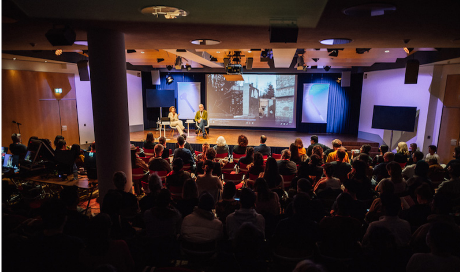
DOK Leipzig 2022

DOK Industry Talk presents initiatives for combating racism and increasing diversity in the film industry