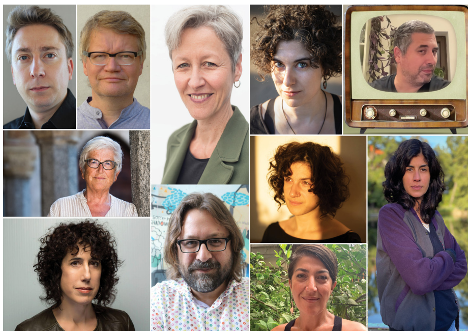
The jurors of DOK Leipzig 2023

Seven Golden Doves and two Silver Doves will go to films in four competitions