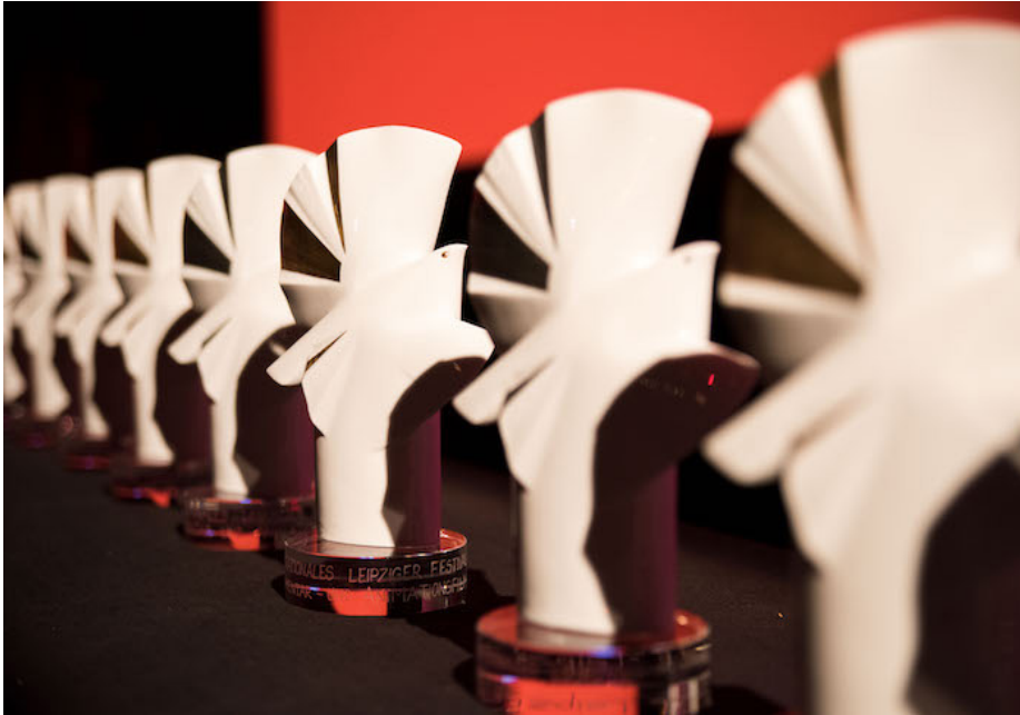
DOK Leipzig 2023

DOK Leipzig owes a huge debt of gratitude to a number of long-standing and new partners, sponsors and patrons for their valuable support. Without their crucial support, this major cultural event, which is so vital to the arts, the film industry and the city, would not be possible.