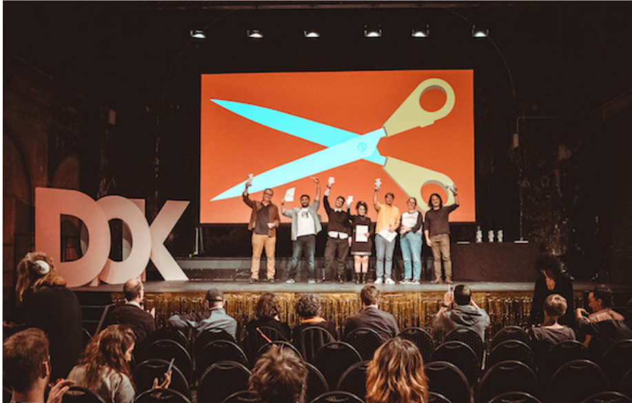
DOK Leipzig 2023 award winners

The 66th edition of DOK Leipzig came to a close on Sunday, 15 October. The Golden and Silver Doves as well as the partnership awards were presented in two award ceremonies on Saturday. In total, the festival counted 45,500 attendees at its cinema screenings, panel discussions, industry events and the DOK Neuland XR exhibition. From 8 to 15 October, audiences had the opportunity to see 225 films and XR works from around 60 countries in venues around Leipzig. In addition, one film a day was available online for 24 hours throughout Germany in the DOK Stream.