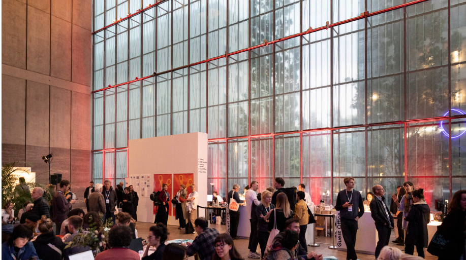
DOK Leipzig 2023

DOK Leipzig has revealed further highlights of the DOK Industry Programme for the 67th festival edition (28 October - 3 November), in addition to the already announced Animation Lab DOK Leipzig , the DOK Co-Pro Market Selection , Ex Oriente Film workshop , and Generation Ukraine showcase . This year's DOK Industry Programme boasts an array of events and activities that foster creative exchange and provide a platform for filmmakers to present their projects and connect with industry peers and potential collaborators. Find the entire Industry Programme on the festival's website .