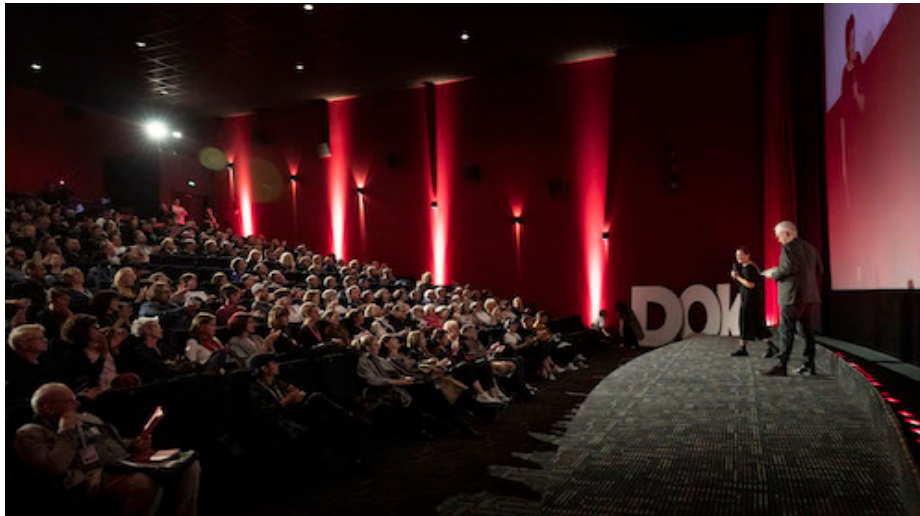
DOK Leipzig 2023

With the 67th edition of DOK Leipzig about to start, it's time to thank our partners, sponsors and patrons, both long-standing and new. Their valuable support is crucial in enabling us to hold a cultural event of such prominence, which draws so much attention to the arts, the film industry and the city.